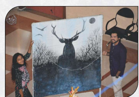
Farewell Ceremony for final year students