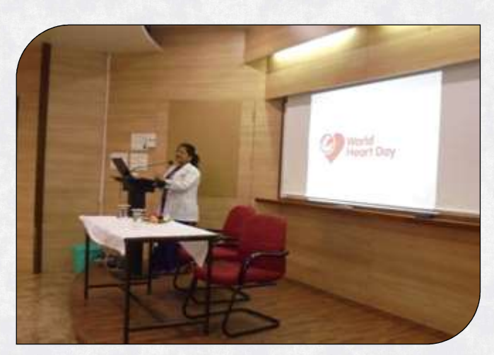
World Heart Day