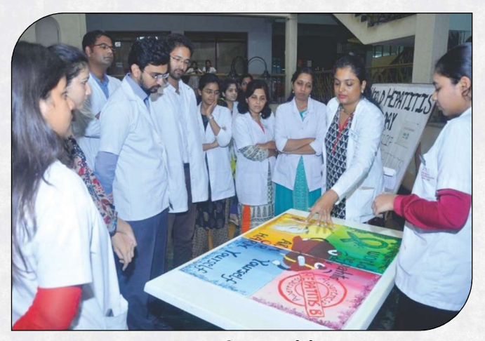
Poster - Competition