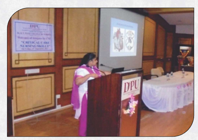
Continue Nursing Education (CNE) Workshop