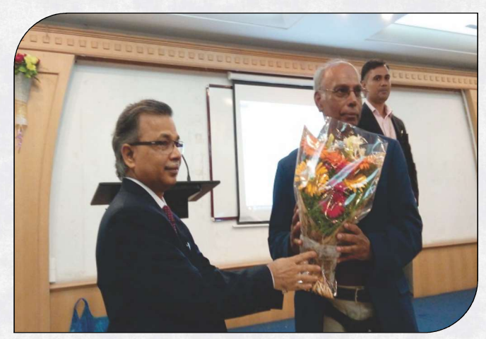
"The role of nitric oxide in cancer drug resistance" by Dr. Birandra. K. Sinha, USA