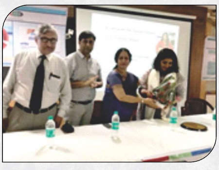
Liver Transplant: The Current Scenario