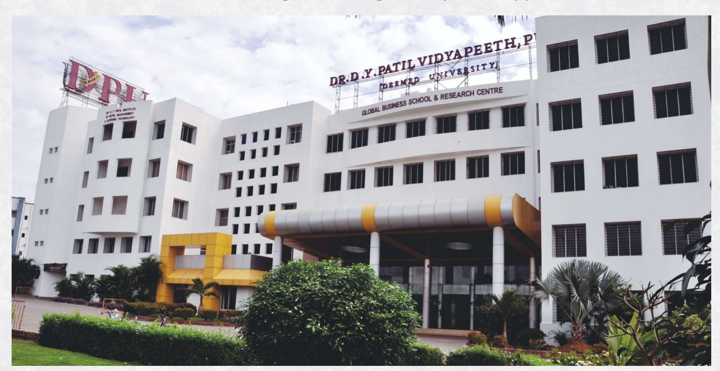
Global Business School and Research Centre, Tathawade, Pune