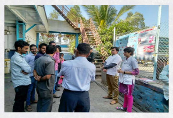
National Cancer Awareness Day

Public Health Dentistry team celebrated National Cancer Awareness Day at Appu Garage MIDC Bhosari Pune on 7th November 2017.Team was headed