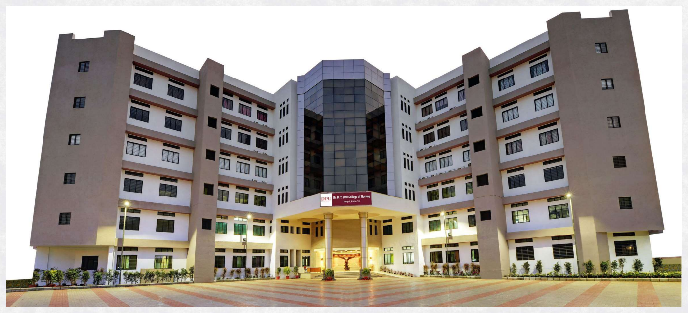
Dr. D. Y. Patil College of Nursing and Physiotherapy, Pune