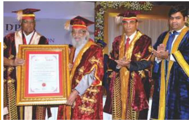
Conferring the degree of Doctor of Letters (Honoris Causa) on Shri. B. M. alias Babasaheb Purandare Eminent Historian and Play-writer