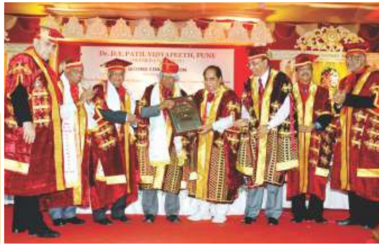
Felicitation of Chief Guest, Dr. A. P. J. Abdul Kalam , Former President of India