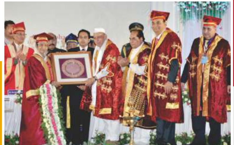
Conferring the degree of Doctor of Letters (Honoris Causa) on Shri. Mohan Dharia Former Cabinet Minister and Eminent Environmentalist