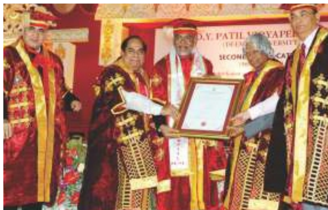
Conferring the degree of Doctor of Letters (Honoris Causa) on Advocate Ujjwal Nikam Special Public Prosecutor, Government of Maharashtra