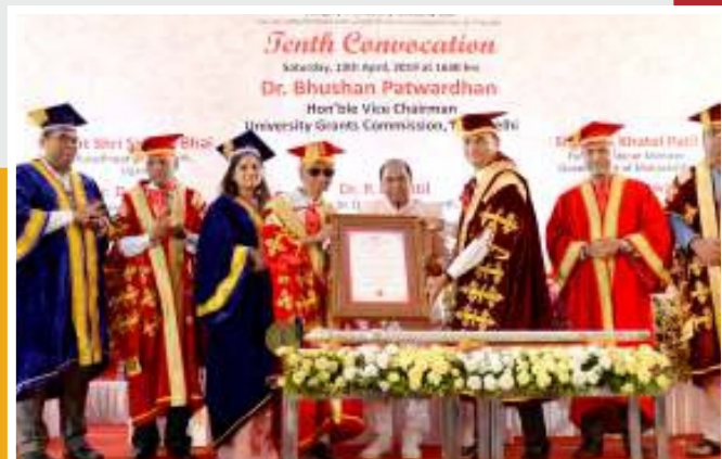
Doctor of Letters degree (Honoris Causa) conferred on Shri B. J. Khatal Patil Former Cabinet Minister, Government of Maharashtra