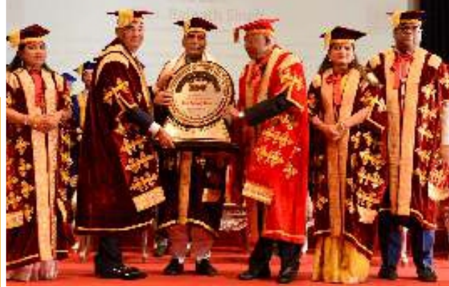
Felicitation of Chief Guest Shri. Rajnath Singh Defence Minister, Government of India