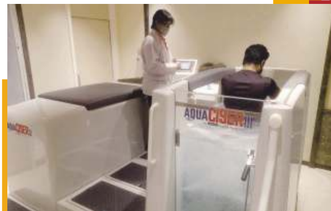
Under Water Treadmill (Aquaciser)

“To educate students of Physiotherapy with advanced technology and sound medical knowledge for rehabilitation”.