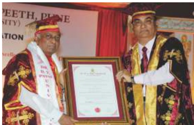
Conferring the degree of Doctor of Science (Honoris Causa) on Dr. Vijay Bhatkar Chairman, ETH Ltd. and former Director CDAC