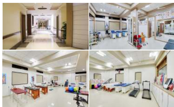
College Building Internal View