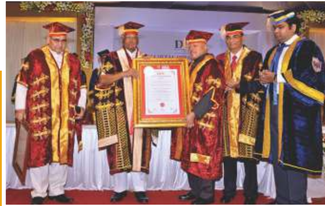
Conferring the degree of Doctor of Science (Honoris Causa) on Prof. M. S. Swaminathan Eminent Agricultural Scientist