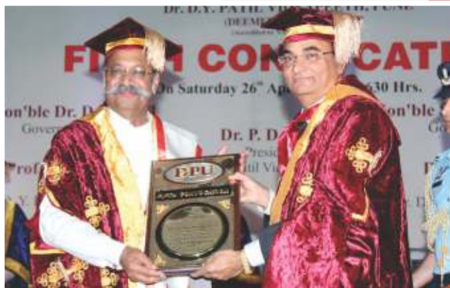
Felicitation of Chief Guest Hon'ble Shri. Shrinivas Patil Governor of Sikkim, India