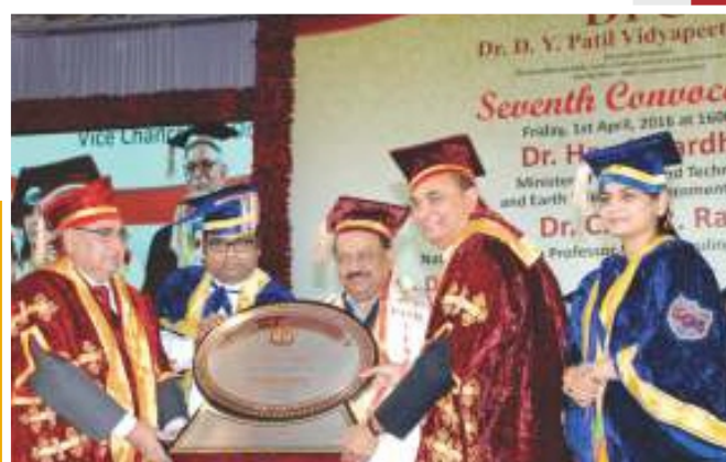
Felicitation of Chief Guest Dr. Harsh Vardhan Minister of Science and Technology and Earth Sciences Government of India