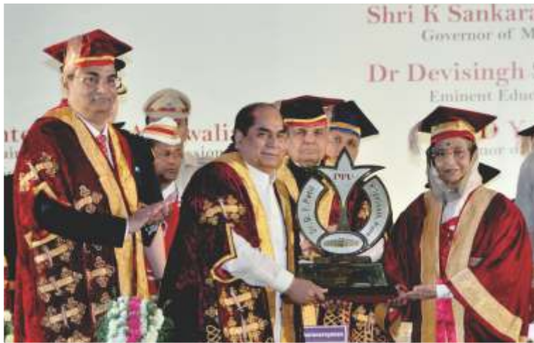
Felicitation of Chief Guest Smt. Pratibha Devisingh Patil President of India