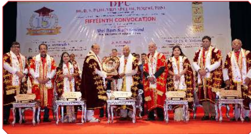
Felicitating of Chief Guest Shri Ram Nath Kovind Hon'ble Former President of India