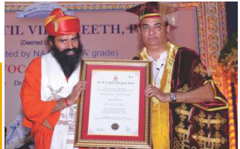
Conferring the degree of Doctor of Science (Honoris Causa) on Prof. U. R. Rao Former Chairman, Indian Space Research Organization (ISRO)