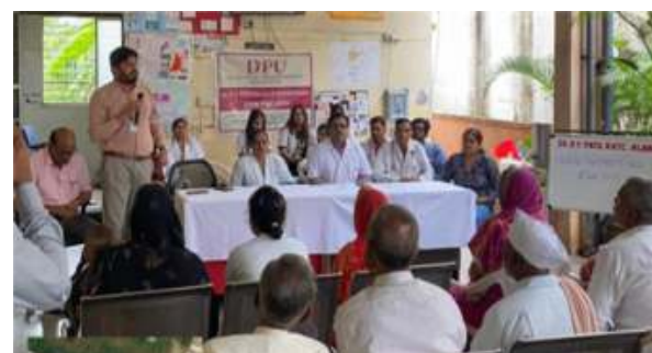
World Physiotherapy Day