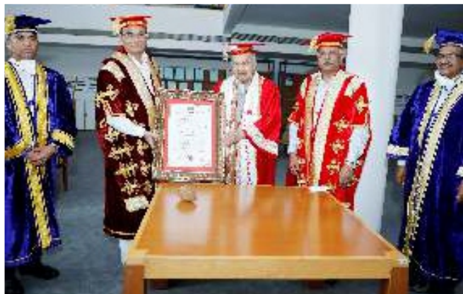
Conferring the Degree of Doctor of Science (Honoris Causa) on Hon'ble Dr. Jayant Narlikar Emeritus Professor, (IUCAA)