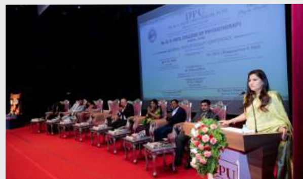
Physio-Drome National Physiotherapy Conference