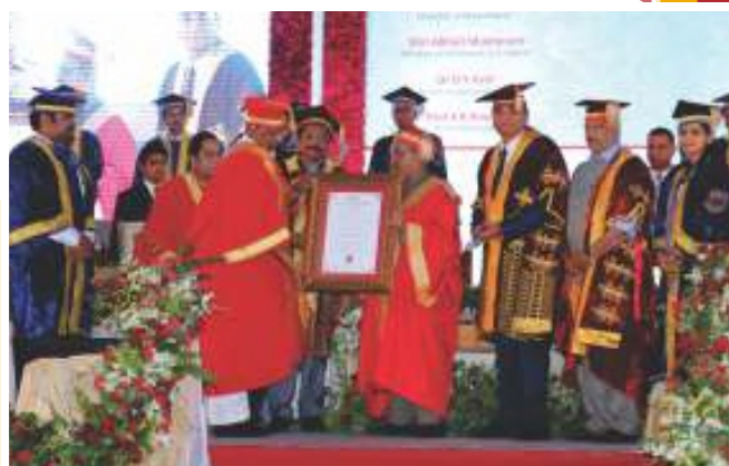
Conferring the degree of Doctor of Letters (Honoris Causa) on Shri. Sharad Pawar Member of Parliament (Rajya Sabha)