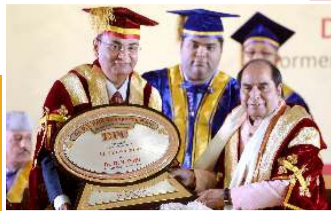
Felicitation of Dr. D. Y. Patil Former Governor of Bihar