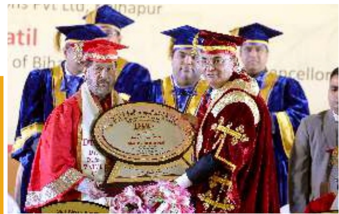
Felicitation of Shri. Girish Bapat Hon'ble Guardian Minister, Pune