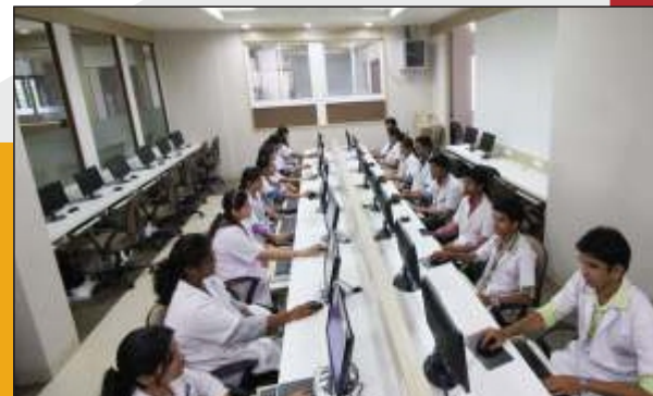
Wi-fi Enabled Lab