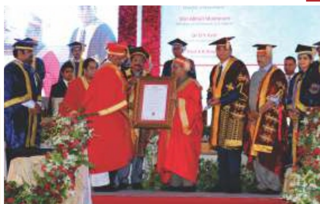
Conferring the degree of Doctor of Science (Honoris Causa) on Dr. Raghunath Mashelkar National Research Professor