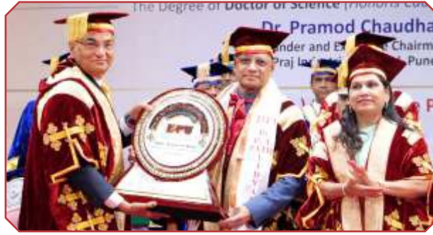
Felicitation of Chief Guest Shri Ramesh Bais Hon'ble Governor of Maharashtra