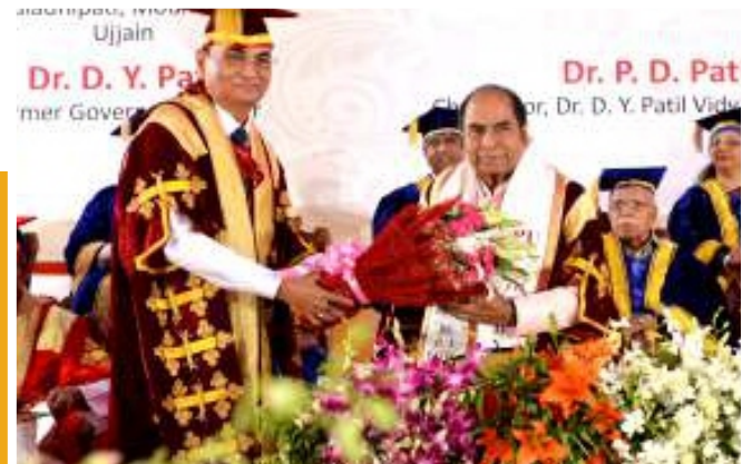
Felicitation of Dr. D. Y. Patil Former Governor of Bihar