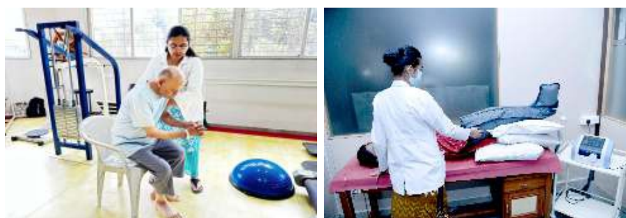
Physiotherapy Out- Patient Department