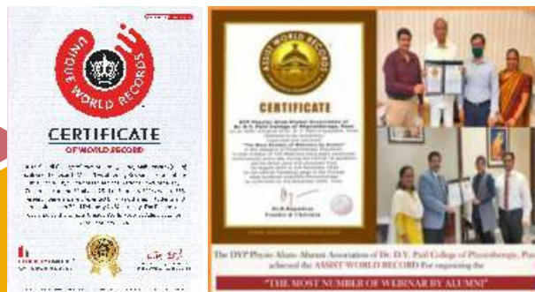
Assist World Record