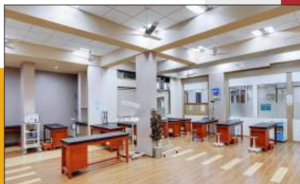
Electrotherapy & Electrodiagnosis Department