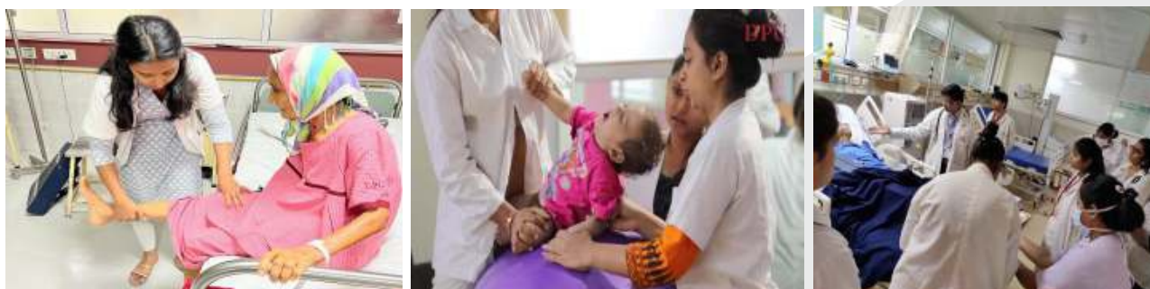
Physiotherapy In-patient services