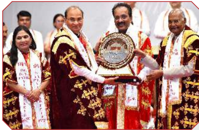
Felicitating of Shri. Somanath S. Chairman - Indian Space Research Organisation (ISRO), Bengaluru Chairman - Space Commission and Secretary - Dept. of Space, GoI