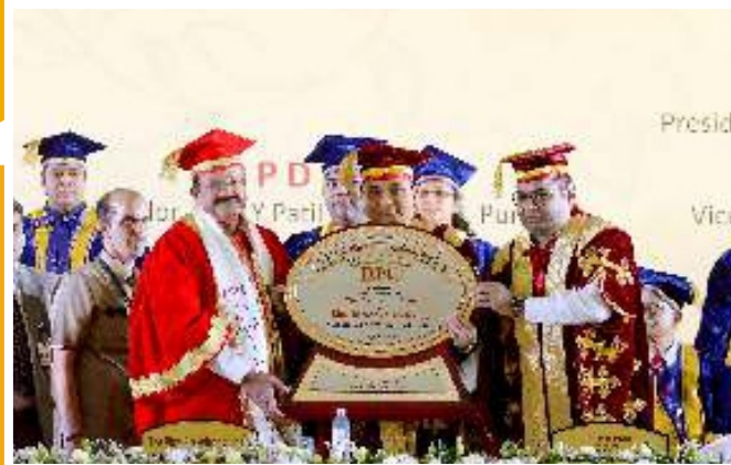
Felicitation of Chief Guest Shri. M. Venkaiah Naidu Hon'ble Vice President of India