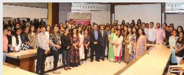
Alumni of DYPCT