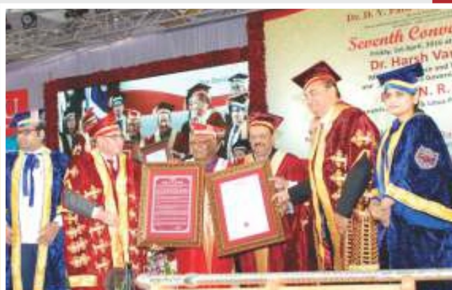
Conferring the degree of Doctor of Science (Honoris Causa) on Dr. C. N. R. Rao National Research Professor & Linus Pauling Research Professor