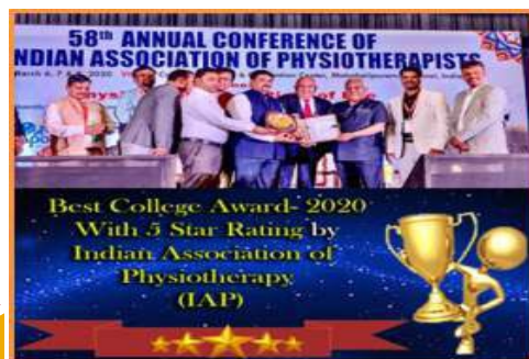
Best College Award -2020 with 5 Star Rating by IAP