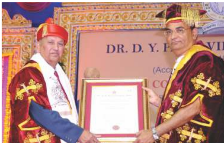
Conferring the degree of Doctor of Letters (Honoris Causa) on Shri. Montek Singh Ahluwalia Deputy Chairman, Planning Commission, Government of India