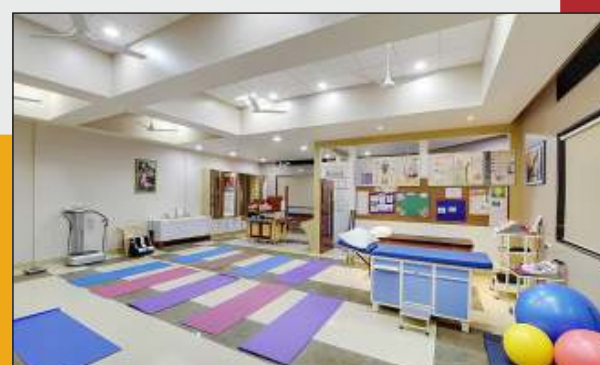
Community Physiotherapy Department