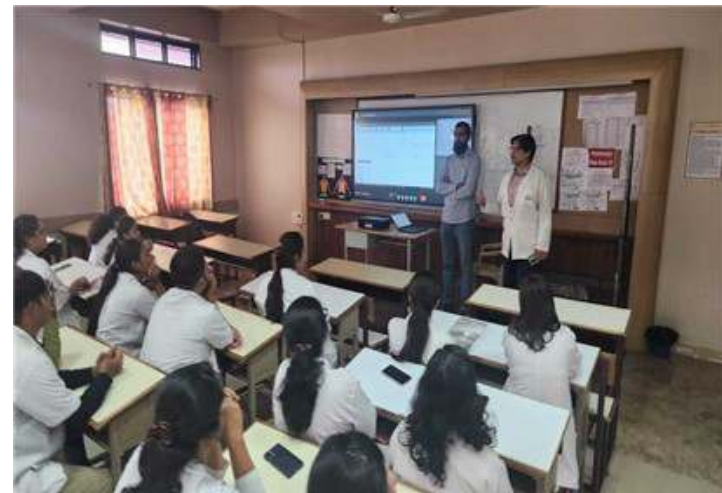
Faculty Development Programme