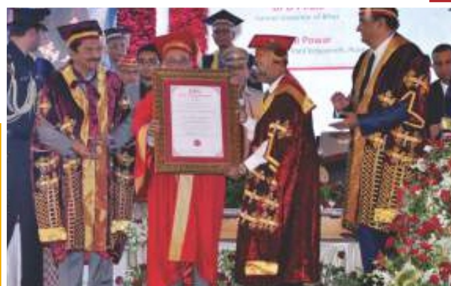
Conferring the degree of Doctor of Science (Honoris Causa) on Shri. Abhijit Mukherjee Member of Parliament (Lok Sabha)