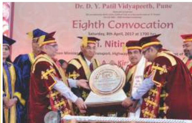
Felicitation of Chief Guest Shri. Nitin Gadkari , Union Minister of Road Transport, Highways and Shipping, Government of India