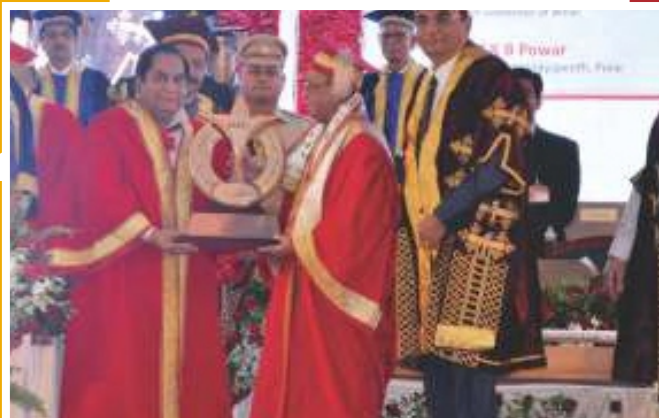
Felicitation of Chief Guest Hon'ble Shri. Pranab Mukherjee President of India