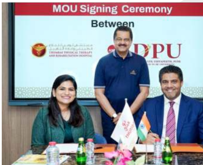
MoU- Thumbay Physical Rehabilitation Hospital, Ajman, UAE