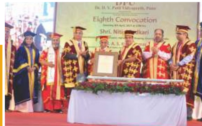
Conferring the degree of Doctor of Science (Honoris Causa) on Shri. A. S. Kiran Kumar , Secretary, Department of Space, Government of India and Chairman (ISRO)