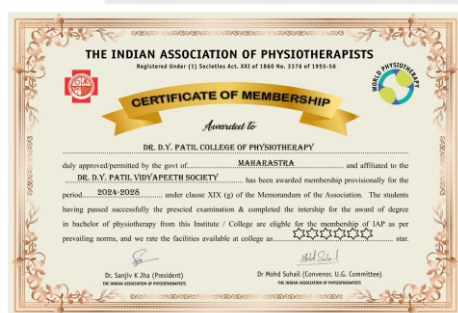
Best College Award -2024 with 6 Star Rating by IAP