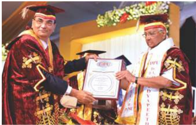
Felicitation of Chief Guest Shri. Sharadchandra Pawar The then Union Minister of Agriculture & Food Processing Industry, Government of India