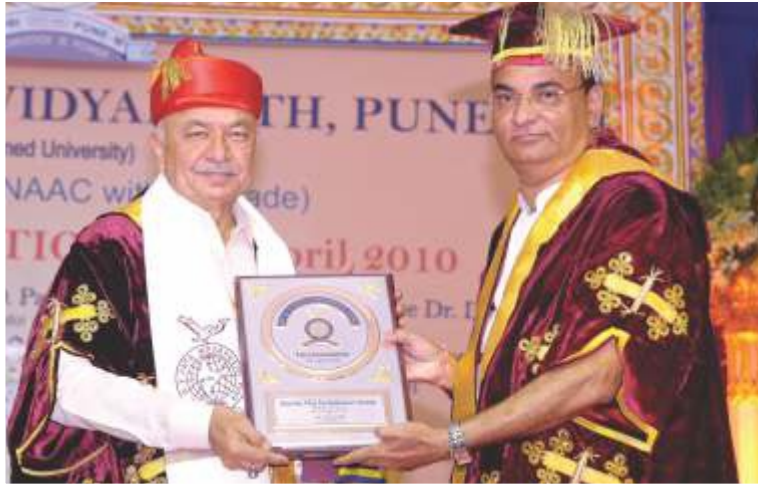
Felicitation of Chief Guest Shri. Sushilkumar Shinde , the then Union Minister of Power, Government of India