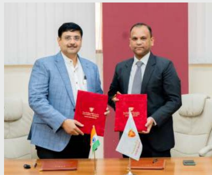
MoU- COHS, Ajman, UAE