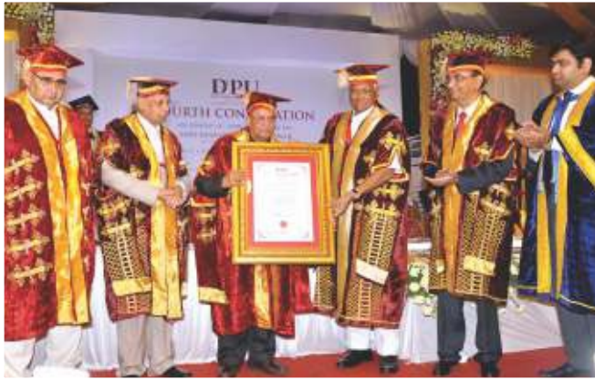
Conferring the degree of Doctor of Science (Honoris Causa) on Dr. Krishnaswamy Kasturirangan an Architect of India's Space Research Programme