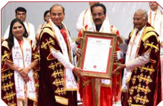
Conferring the Degree of Doctor of Science ( Honoris Causa ) on Shri. Somanath S. Chairman - Indian Space Research Organisation (ISRO), Bengaluru Chairman - Space Commission and Secretary - Dept. of Space, GoI