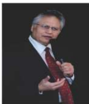
Mr. Shiv Khera (Author- You Can Win, Motivational Speaker, Educator, Business Consultant)