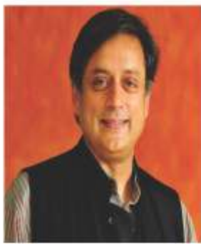
Dr. Shashi Tharoor ( Member of Parliament, Writer and former International diplomat)