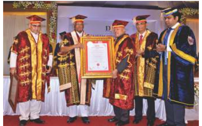
Conferring the degree of Doctor of Science ( Honoris Causa ) on Prof. M. S. Swaminathan , Eminent Agricultural Scientist