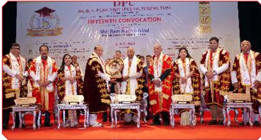
Felicitation of Chief Guest Shri Ram Nath Kovind Hon'ble Former President of India