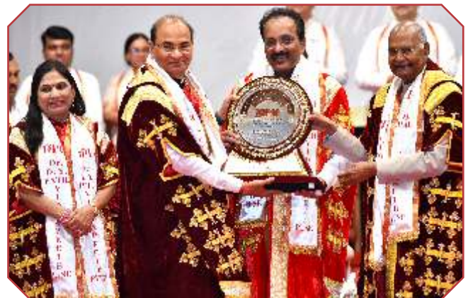
Felicitation of Shri. Somanath S. Chairman - Indian Space Research Organisation (ISRO), Bengaluru Chairman - Space Commission and Secretary - Dept. of Space, GoI