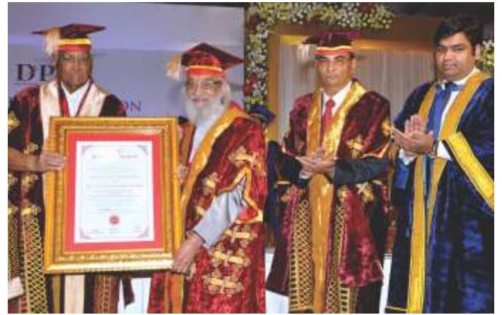
Conferring the degree of Doctor of Letters ( Honoris Causa ) on Shri. B. M. alias Babasaheb Purandare , Eminent Historian and play-writer