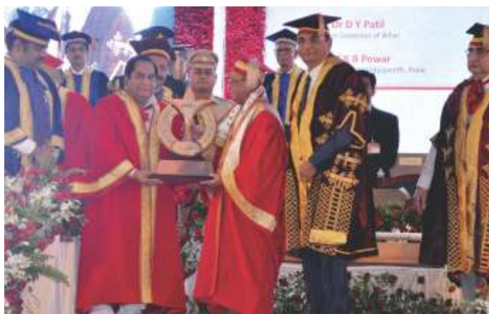
Felicitation of Chief Guest Hon'ble Shri. Pranab Mukherjee, President of India