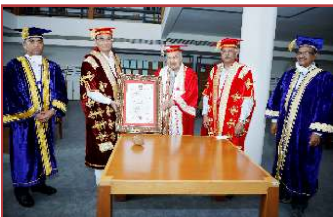
Conferring the Degree of Doctor of Science ( Honoris Causa ) on Hon'ble Dr. Jayant Narlikar Emeritus Professor, (IUCAA)