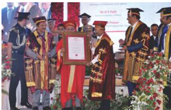
Conferring the degree of Doctor of Science ( Honoris Causa ) on Shri. Abhijit Mukherjee Member of Parliament (Lok Sabha)