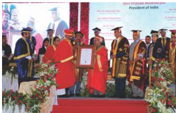
Conferring the degree of Doctor of Letters ( Honoris Causa ) on Shri. Sharad Pawar, Member of Parliament (Rajya Sabha)