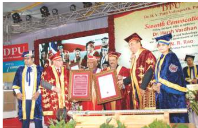
Conferring the degree of Doctor of Science ( Honoris Causa ) on Dr. C. N. R. Rao, National Research Professor & Linus Pauling Research Professor