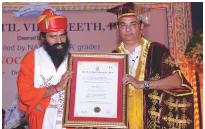
Conferring the degree of Doctor of Science ( Honoris Causa ) on Prof. U. R. Rao Former Chairman, Indian Space Research Organization (ISRO)