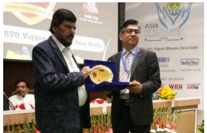
Best B-School Award in Asian Education Summit at Vigyan Bhavan, New Delhi