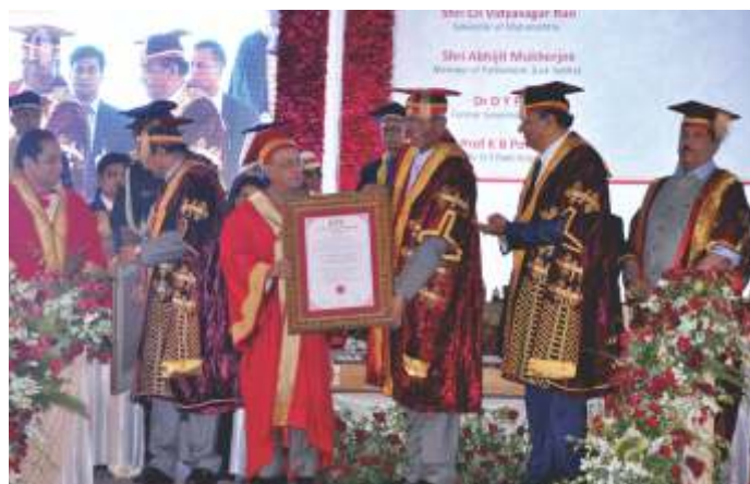
Conferring the degree of Doctor of Science ( Honoris Causa ) on Dr. Raghunath Mashelkar National Research Professor