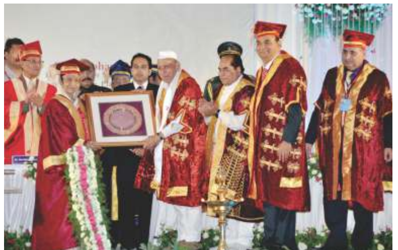
Conferring the degree of Doctor of Letters ( Honoris Causa ) on Shri. Montek Singh Ahluwalia, Deputy Chairman, Planning Commission, Government of India