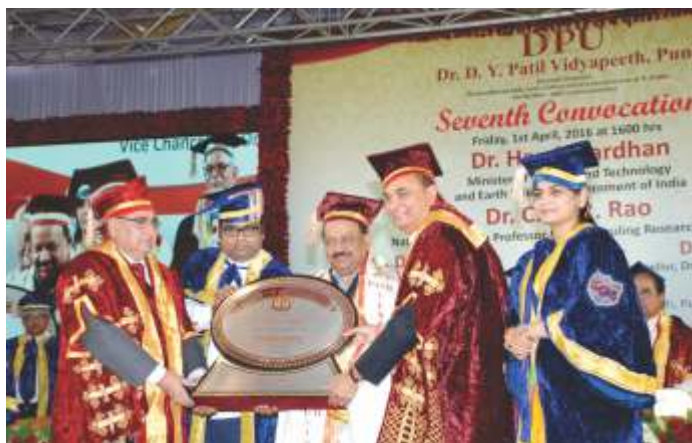
Felicitation of Chief Guest Dr. Harsh Vardhan, Minister of Science and Technology and Earth Sciences Government of India