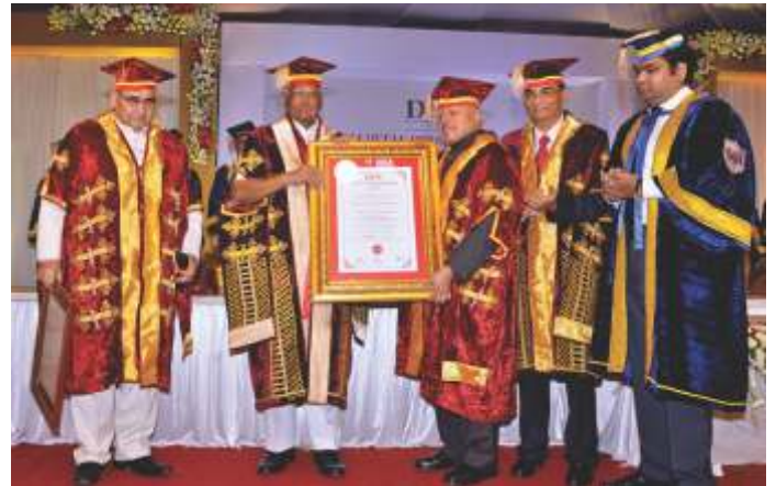
Conferring the degree of Doctor of Science ( Honoris Causa ) on Prof. M. S. Swaminathan , Eminent Agricultural Scientist