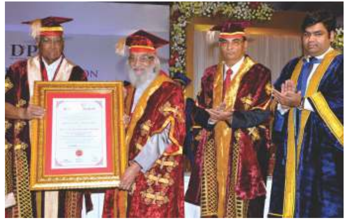
Conferring the degree of Doctor of Letters ( Honoris Causa ) on Shri. B. M. alias Babasaheb Purandare , Eminent Historian and play-writer