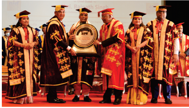
Felicitation of Chief Guest Shri. Rajnath Singh Defence Minister, Government of India