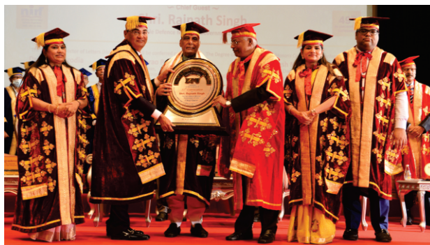
Felicitation of Chief Guest Shri. Rajnath Singh Defence Minister, Government of India