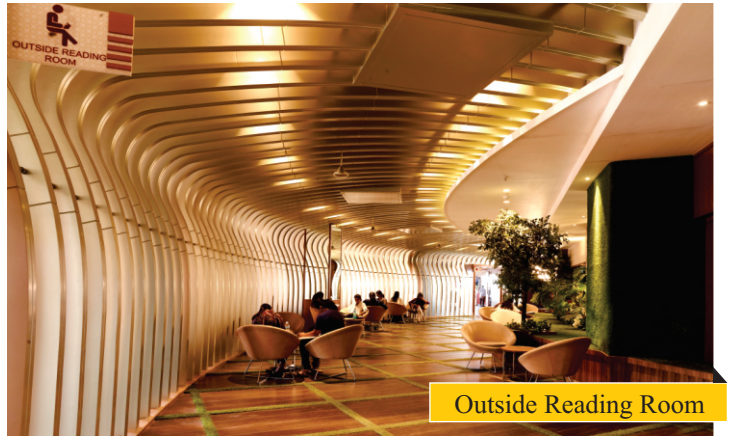
Outside Reading Room