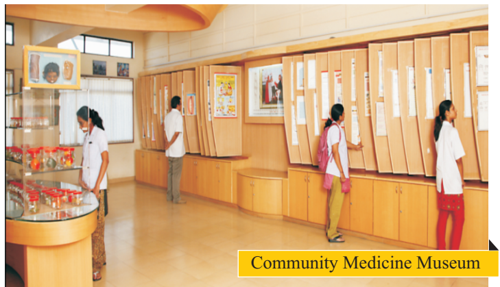
Community Medicine Museum