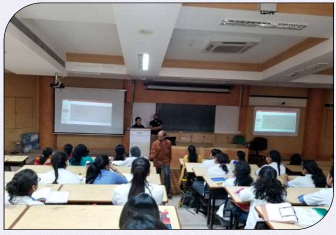
Guest Lecture organized on "Yoga & Pranayama"