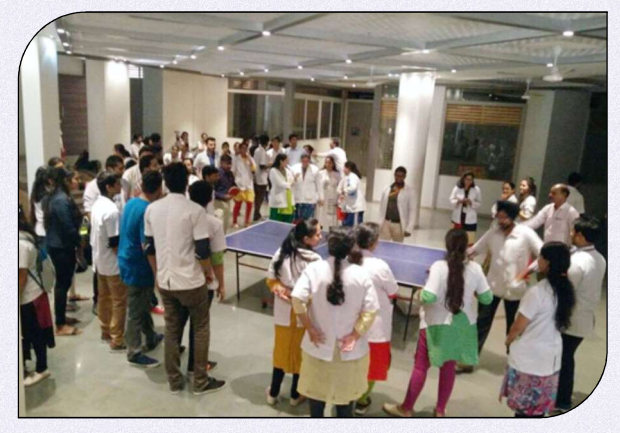
Table Tannis Competition 27th Feb. to 9th Mar. 2017