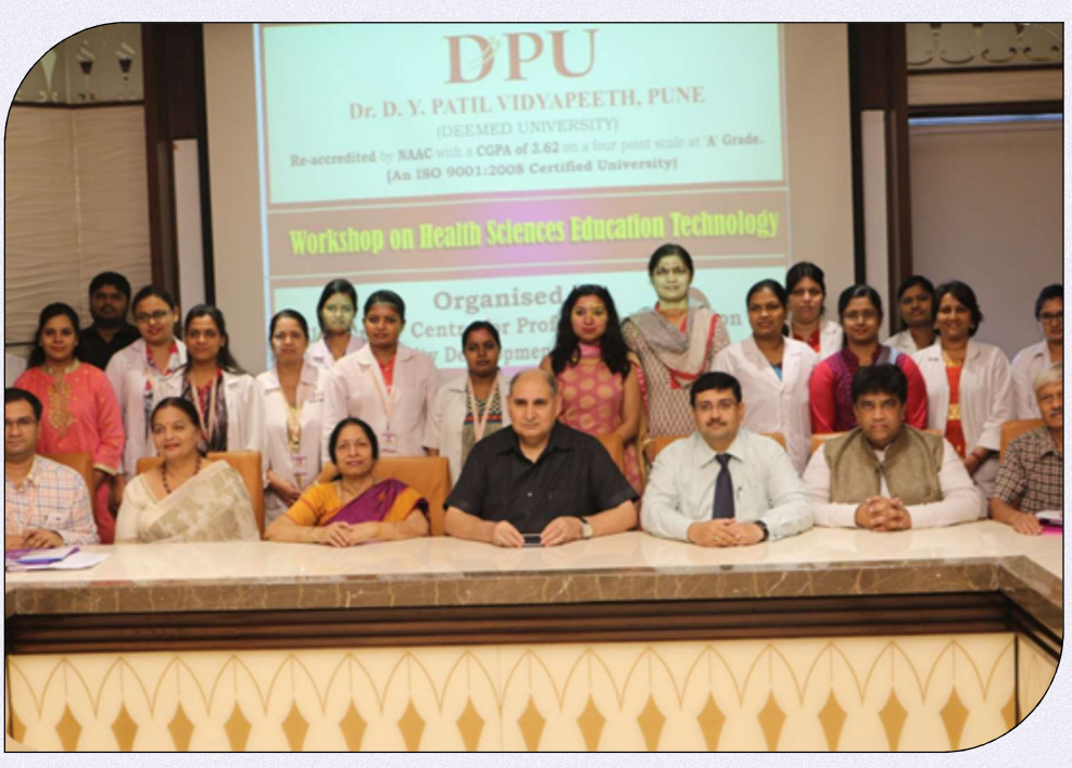
Hon'ble Vice Chancellor with resource faculty and participants