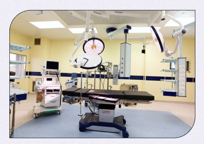
Operation Theatre at Hi-Tech Hospital