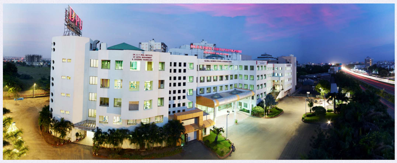
Global Business School and Research Centre, Tathawade, Pune