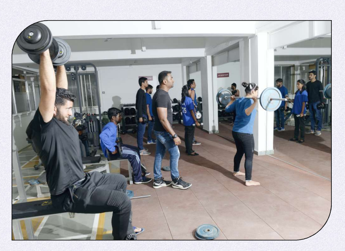
Gym at GBS&RC