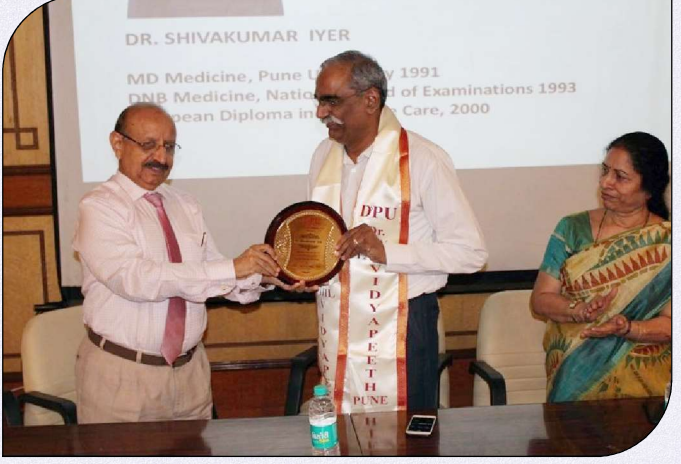
Guest Lecture "Sepsis: Current Concepts & Guidelines"