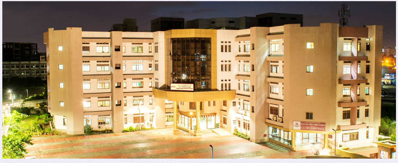
Dr. D. Y. Patil Homoeopathic Medical College and Research Centre