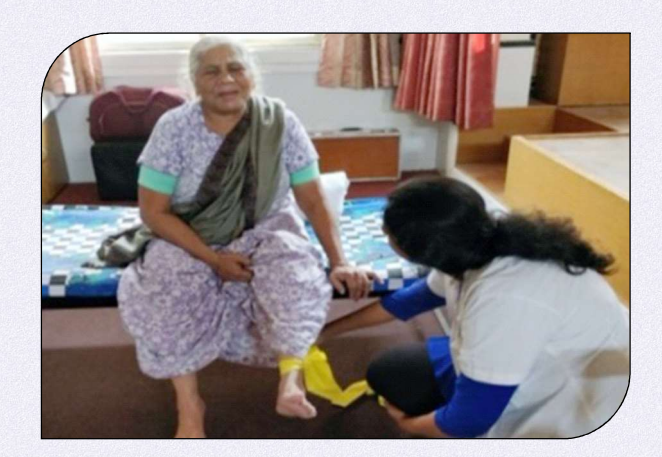
Geriatric Physiotherapy Screening camp on 10th of January 2018