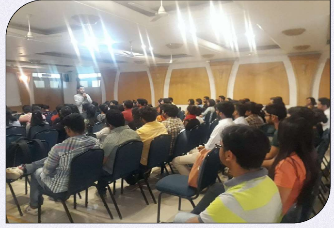
An Interaction with Happiness