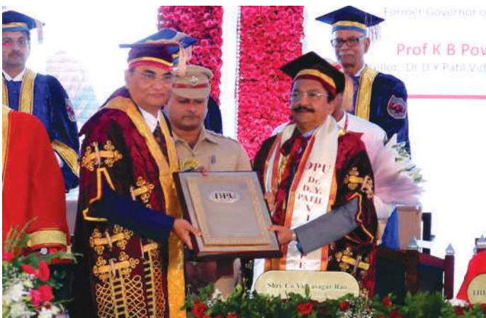
Felicitation of Shri. CH Vidyasagar Rao Governor of Maharashtra