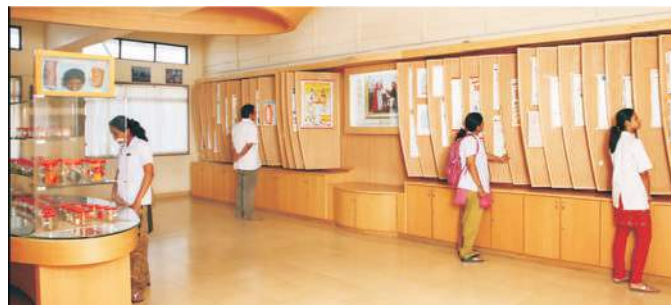
■ Community Medicine Museum