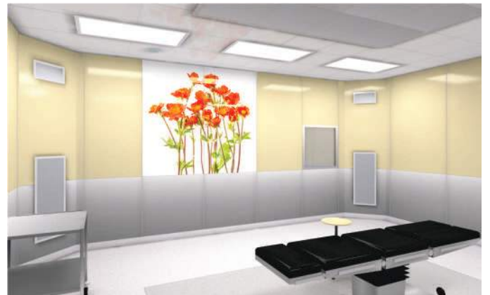
■ Cath Lab