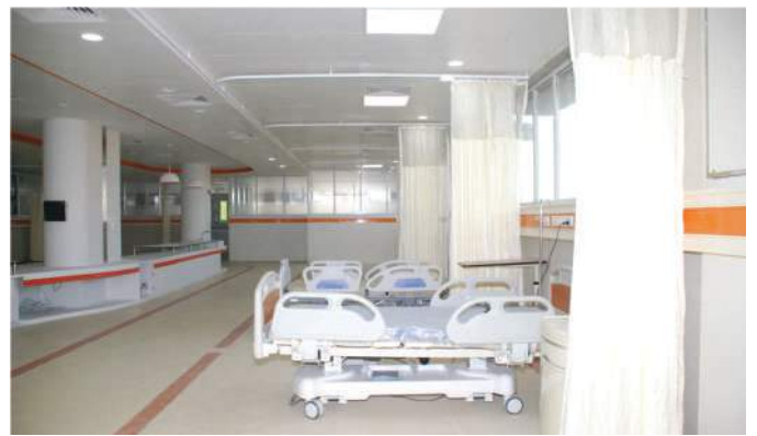
■ Intensive Care Units (ICUs)