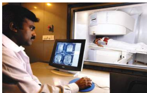
■ MRI - I