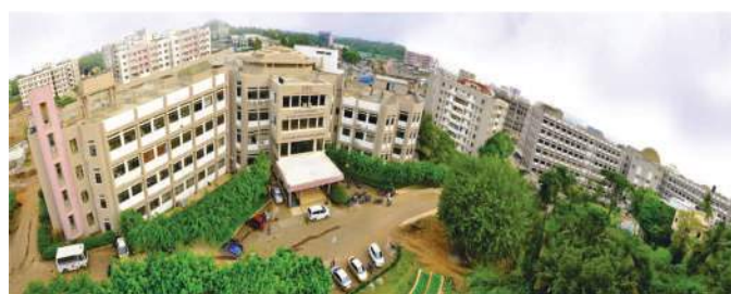
■ Vidyapeeth Campus

Dr. D. Y. Patil Vidyapeeth, Pune Administrative Building and Dr. D. Y. Patil Medical College, Hospital and Research Centre are located in the same sprawling campus at Pimpri. The college building is a masterpiece of architecture and has state-of-the-art facilities that are in tune with the best in the world. The college building basks in fine aesthetics and is impressive. It has a mural of Lord Dhanvantari on its facade and the magnificent fibre glass dome that can be seen from miles around. The college has a comprehensive set of 24 departments that make a complete learning.