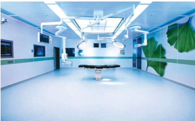
■ Operation Theaters