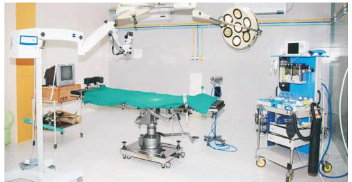
■ Operation Theatre