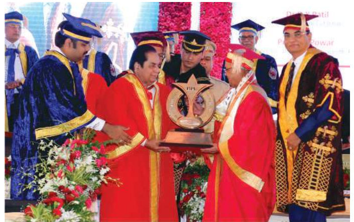
Felicitation of Chief Guest Shri. Pranab Mukherjee President of India