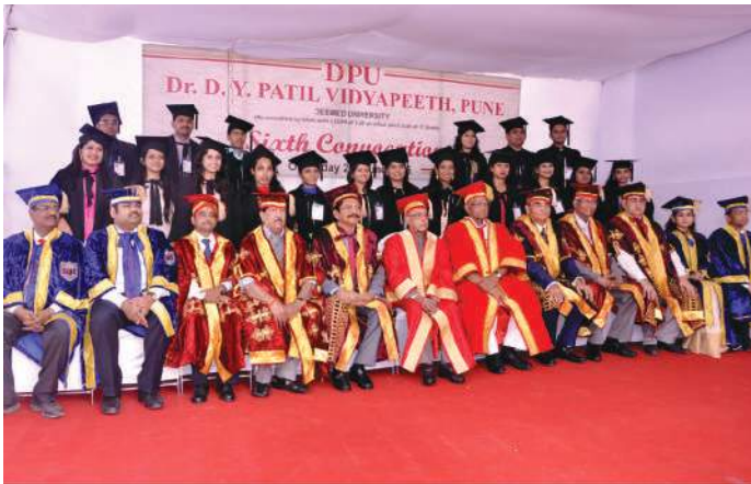
Gold Medal Awardees with Chief Guest