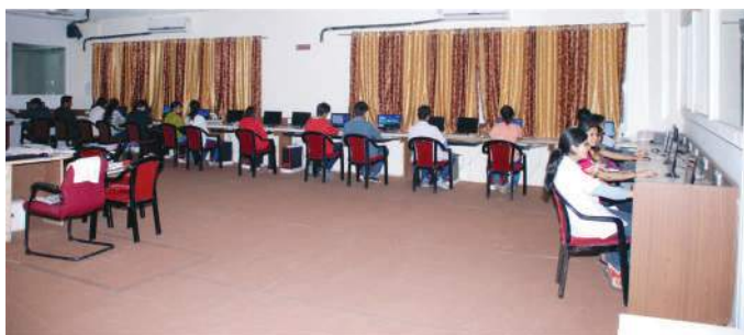
■ Internet Section & e-Library