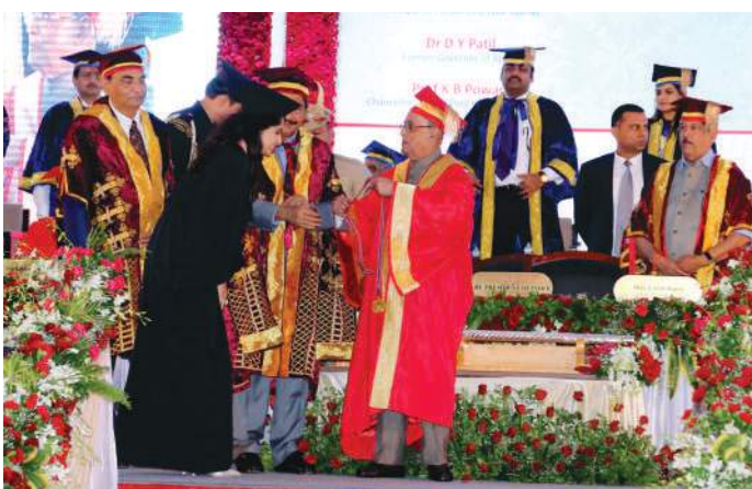
Gold Medal Awarded by Hon'ble Shri. Pranab Mukherjee President of India