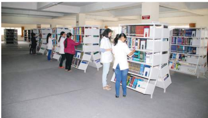
■ Library - Reference Section

The central library has been provided with Wi-Fi internet facility and students and the faculty have open access to this facility. As the College and hostels are 'Wi-Fi' enabled, the students can access information from any point any where.