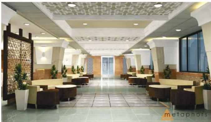
■ Entrance Lobby

Cancer diagnostic & treatments including radiotherapy, ultra fast cardiac C. T. scan, In-Vitro Fertilization and embryo transplant (test tube baby), trauma centre, eye bank, stem cell bank, bone marrow bank, blood bank with component separation facility, Cardiac, surgical, medical, neonatal & paediatric intensive care units, etc. The hospital is proposed to have a helipad with facilities for air ambulance in case of emergencies