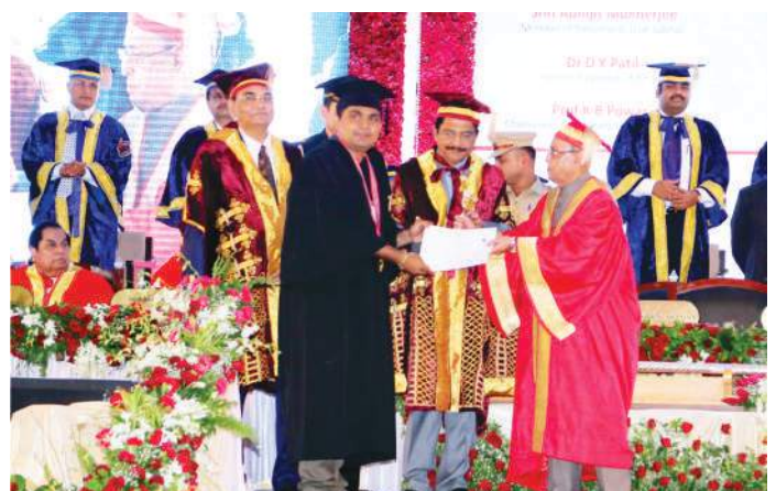
Gold Medal Awarded by Hon'ble Shri. Pranab Mukherjee President of India