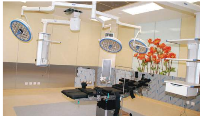
■ Operation Theaters