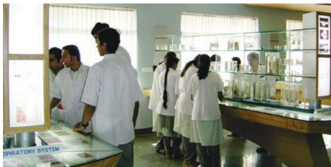
■ Pathology Museum