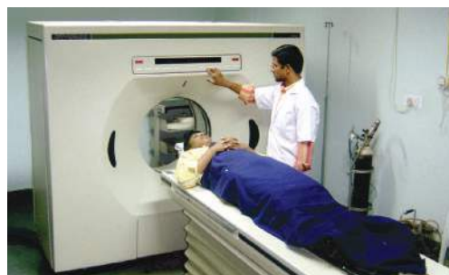
■ CT - SCAN