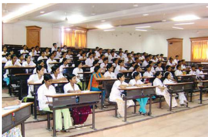
■ Lecture Hall

The college has five well laid-out lecture halls; six with seating capacity of 300 each and three examination halls with seating capacity of 250 each. The desks are well spaced out and halls are airy, well-lit and have fine acoustics. Each hall also has the latest audio visual teaching aids. All other aspects pertaining to medical learning have been taken into account in planning and making of these lecture halls.