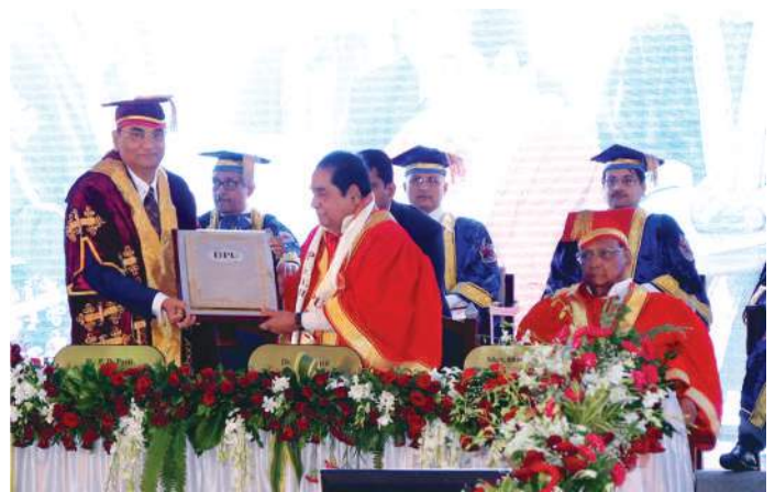
Felicitation of Dr. D. Y. Patil Former Governor of Bihar