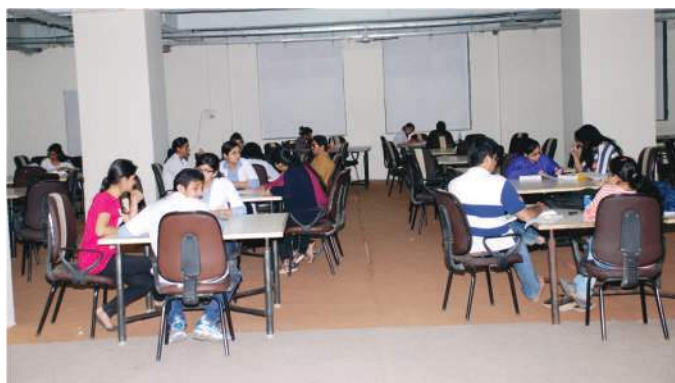
■ Library - Reading Hall