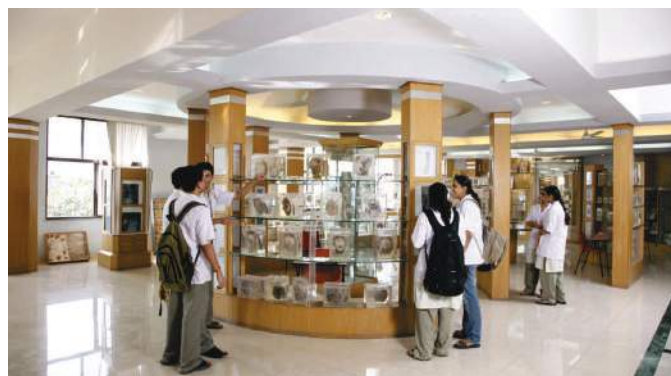
■ Anatomy Museum

A good hospital gives any medical college a fine learning reputation. The hospital provides ample and varied clinical material to the students, enabling them to be conversant with multitudes of ailments, infirmities and diseases and treatments thereon. Dr. D. Y. Patil Medical College has a 1290 bed hospital with all modern amenities and equipments from the learning point of view. It caters to all the specialities and is manned by highly qualified, successful and experienced faculty members. The hospital is well equipped with modern amenities required for treatment including C.T. Scan, Colour Doppler, MRI, Sonography, Endoscopy, Colposcopy, Lithotripsy Machine, 100 watt Holmium Laser Unit with C-Arm and Image Intensifier, latest models of anaesthetic machines, Bactec Systems, Real Time PCR. The hospital has excellent backup of the supporting departments and ultra modern laboratories.