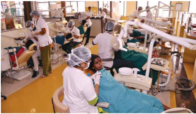
■ P. G. Clinic