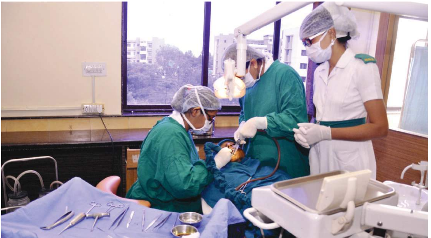
■ Minor Operation Theatre