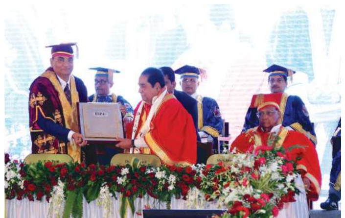
Felicitation of Dr. D. Y. Patil Former Governor of Bihar