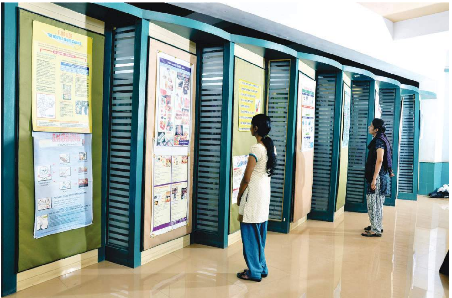
■ Patients Education & Treatment Camp