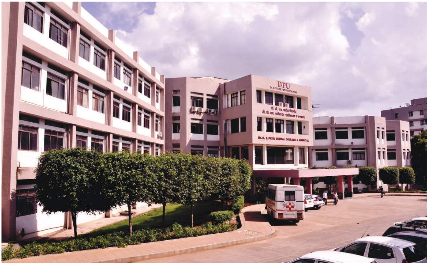
■ Dental College Bulding

The intake of the College is 100 students per year for the Bachelor of Dental Surgery (BDS) course and 49 for Master of Dental Surgery (MDS) courses in nine dental specialties. The Ph.D. Programme in all Specialities is also available in Dental College. The College is well known for its highly qualified and experienced faculty. All the nine specialties are more than adequately manned by Professors, Readers, Lecturers, Tutors and Dental Surgeons, as per the DCI norms. The College is housed in a spacious, well planned building which accommodates all the departments and their 'state-of-the-art' facilities. The well-equipped laboratories and infrastructural facilities are an integral part of the excellent academic activities.