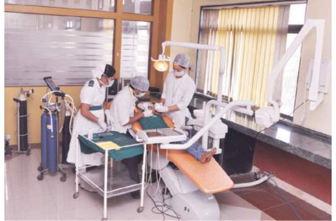
■ Minor OT (Pedo)