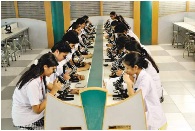
■ Pathology Laboratory