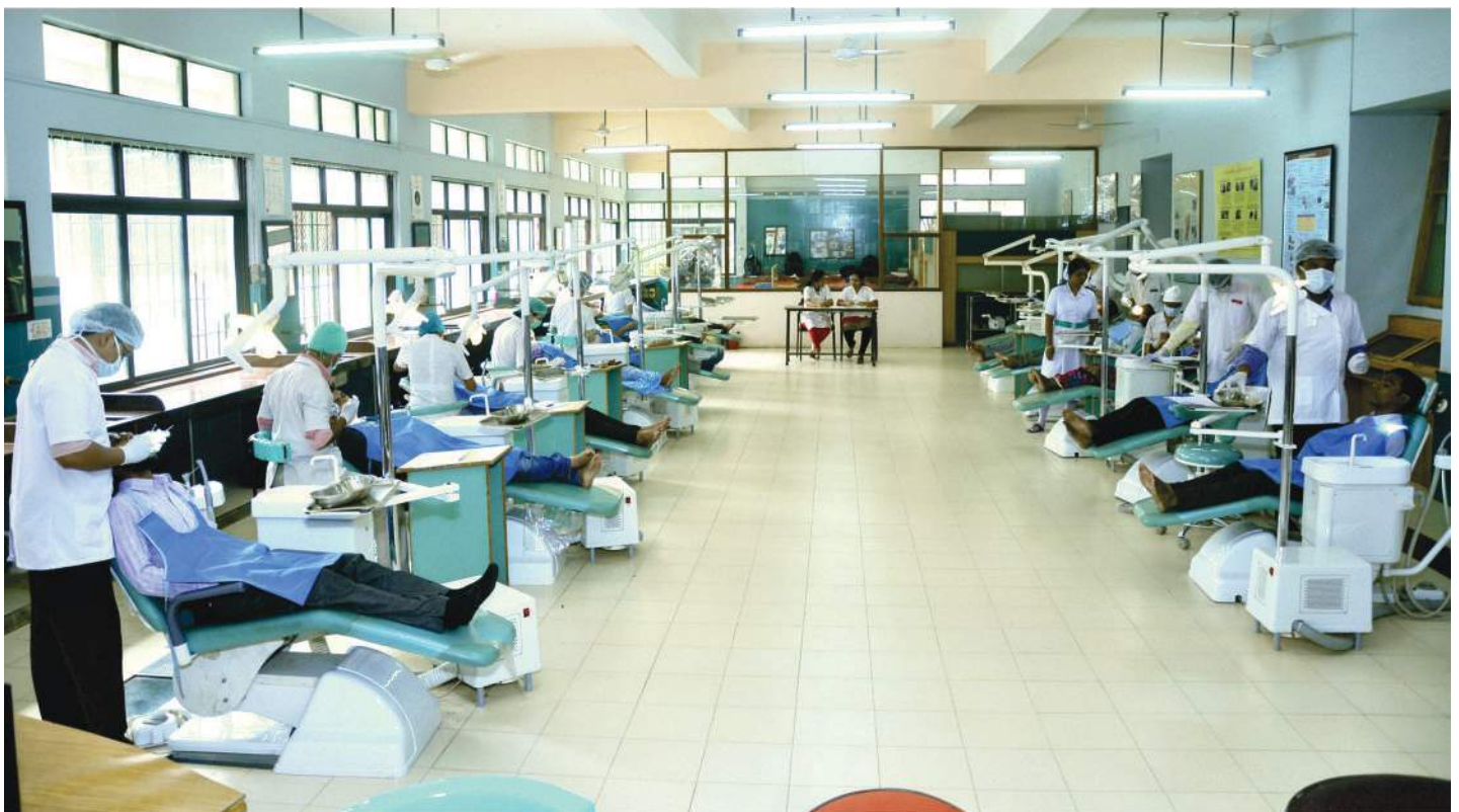
■ OPD Clinic