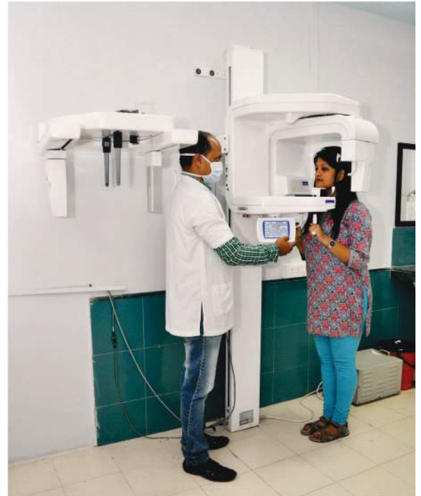
■ Digital OPG Machine