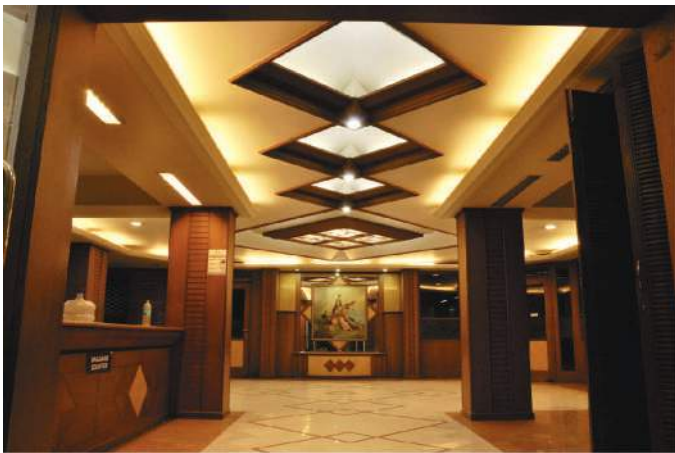
■ Learning Resource Centre