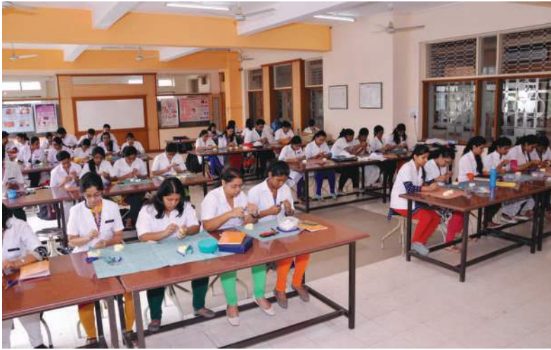
■ Pre-clinical Orthodontics