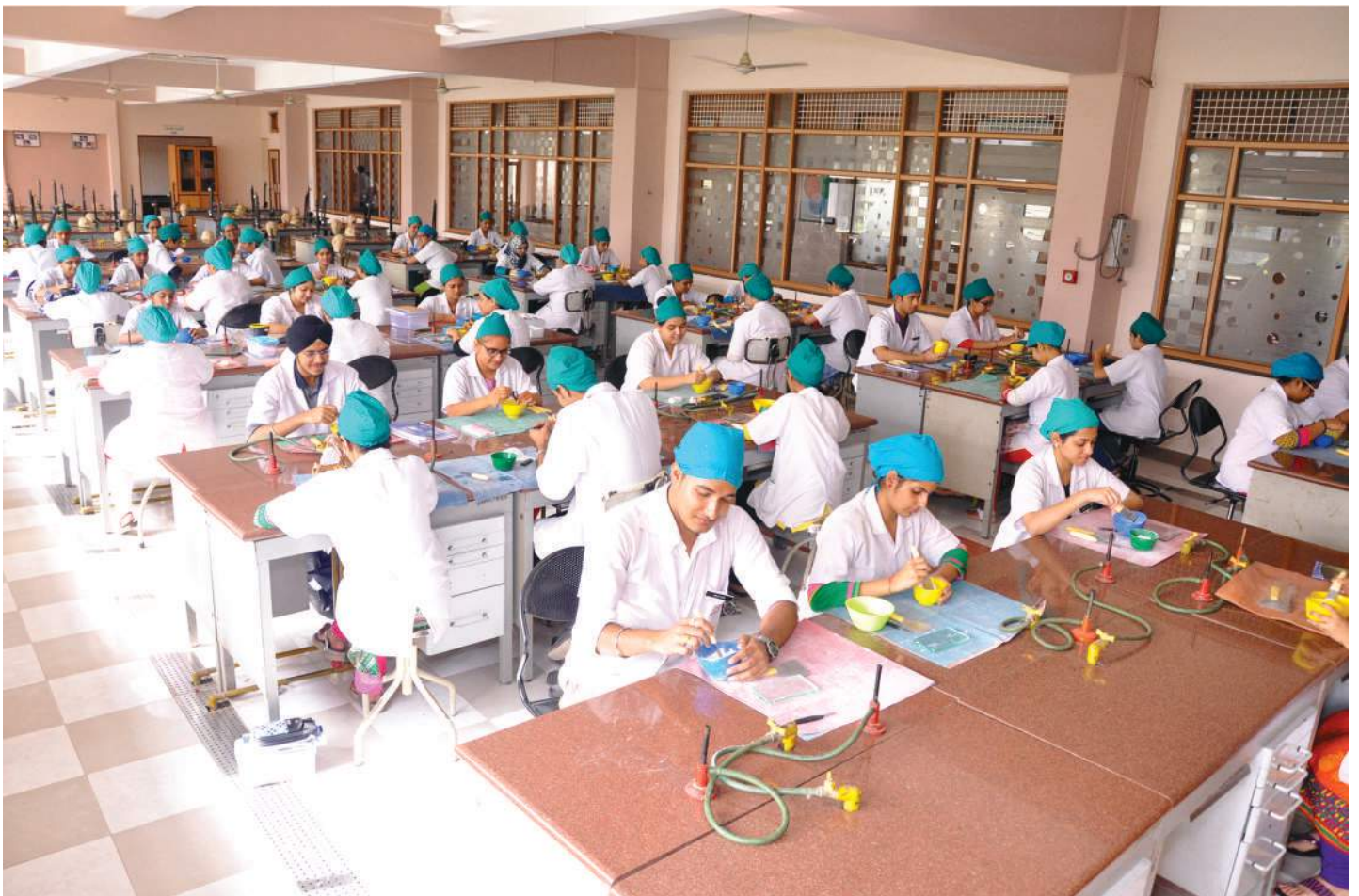
■ Pre-Clinical Laboratory