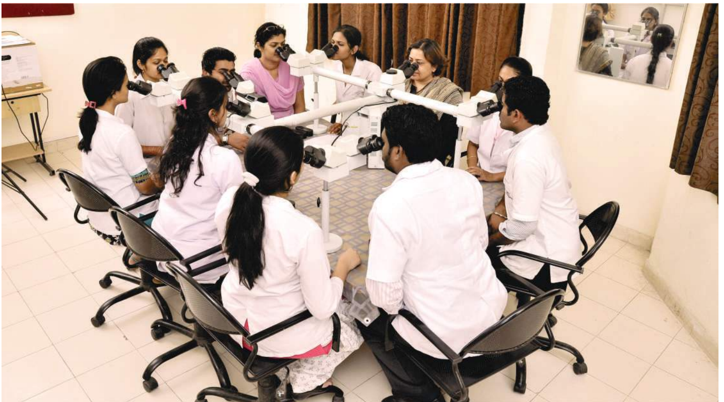
■ Decahead Microscope