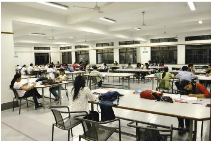
■ Reading Room