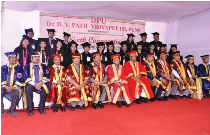
Gold Medal Awardees with Chief Guest