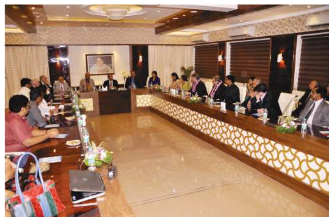
■ Council Hall